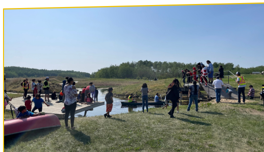
Canoe Races during Evacuation