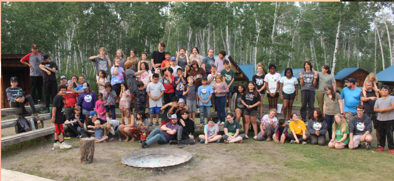
Fort Vermilion and North & South Tall Cree