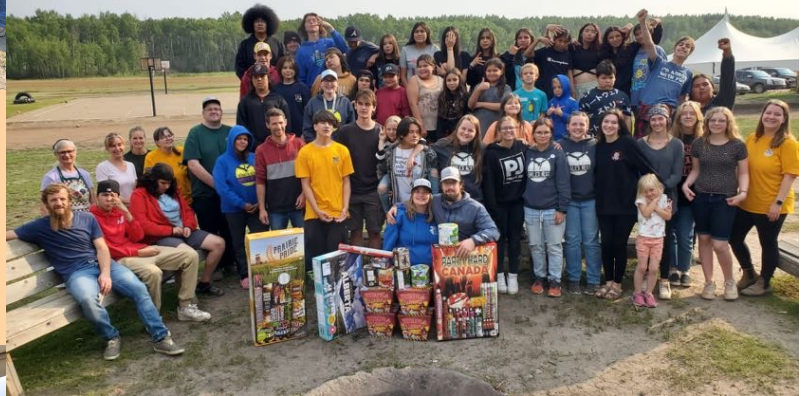
Beaver First Nation